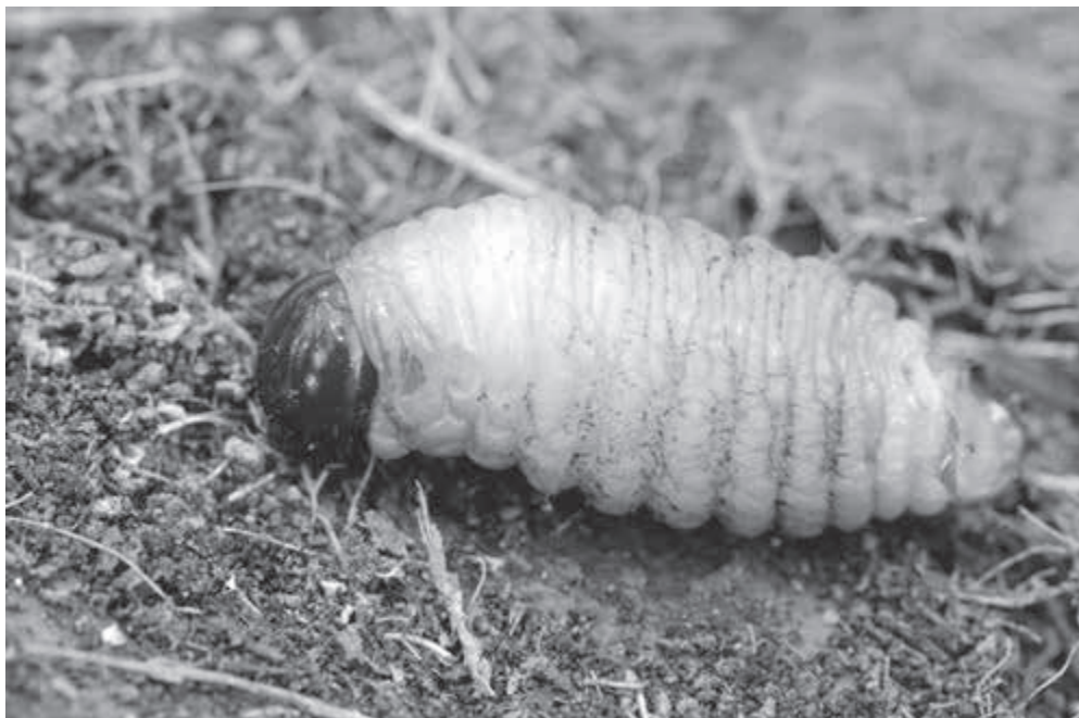
Magnification \times 10

The photograph below shows a larva of R. ferrugineus .