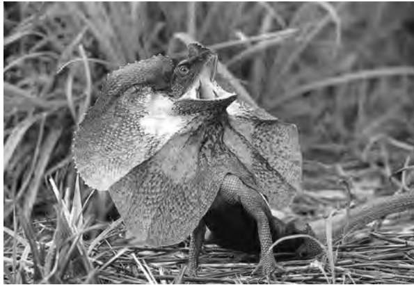
Magnification \times 0.1

Male frilled lizards display their frill to attract females. A successful male may mate with many females.